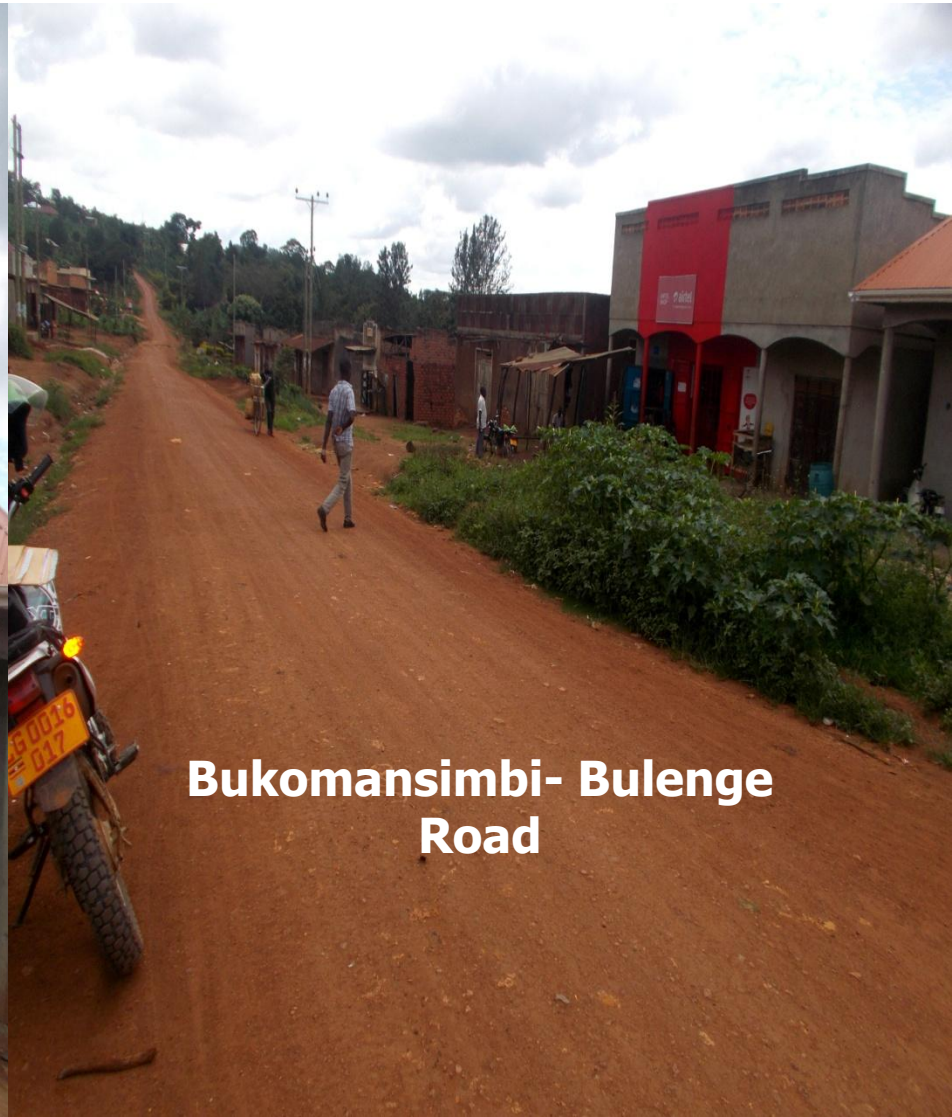
Bukomansimbi- Bulenge Road