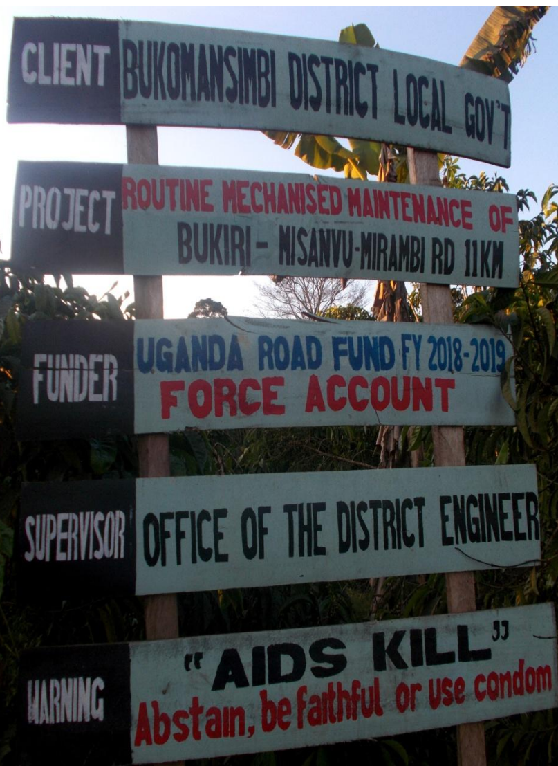
Bukirii-Misanvu- Mirambi Road