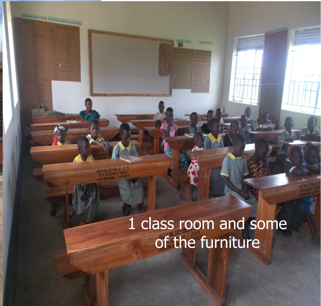
1 class room and some of the furniture