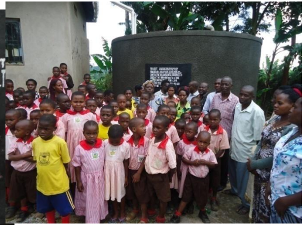
Above: Commissioning a 30,000 Ltrs Rainwater harvesting tank at St. Bernard Kateera P/S, Kibinge

PROJECT: CONSTRUCTION OF A 30,000LTRS RAIN WATER HARVESTING TANK FUNDED BY: BUKOMANSIMBI DISTRICT WATER AND SANITATION CONDITIONAL DEVELOPMENT GRANT CONTRACTOR: BEKABYE GENERAL ENTERPRISES LTD CONTRACT NO.: BUKO 600/WRKS/18-19/0002. YEAR OF CONSTRUCTION: 2018 / 2019. LOCATION: ST. BERNARD KATEERA PRI. SCH FACILITY NO.: 600RHT 319