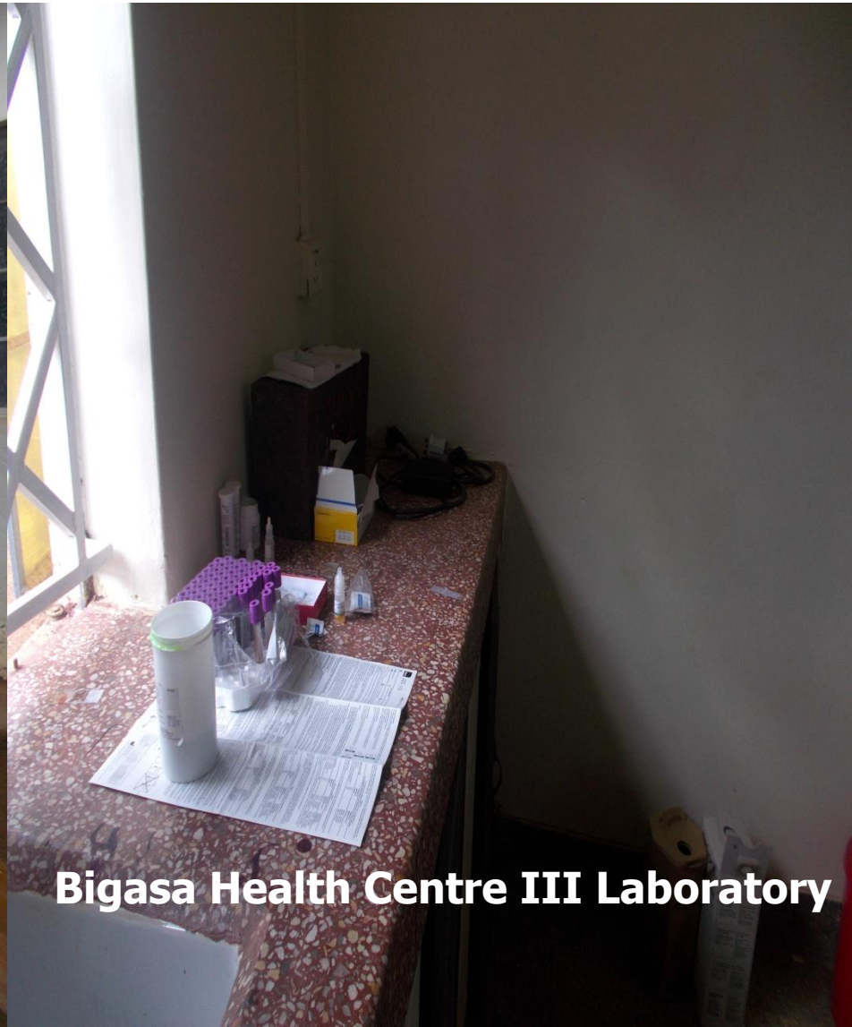
Bigasa Health Centre III Laboratory