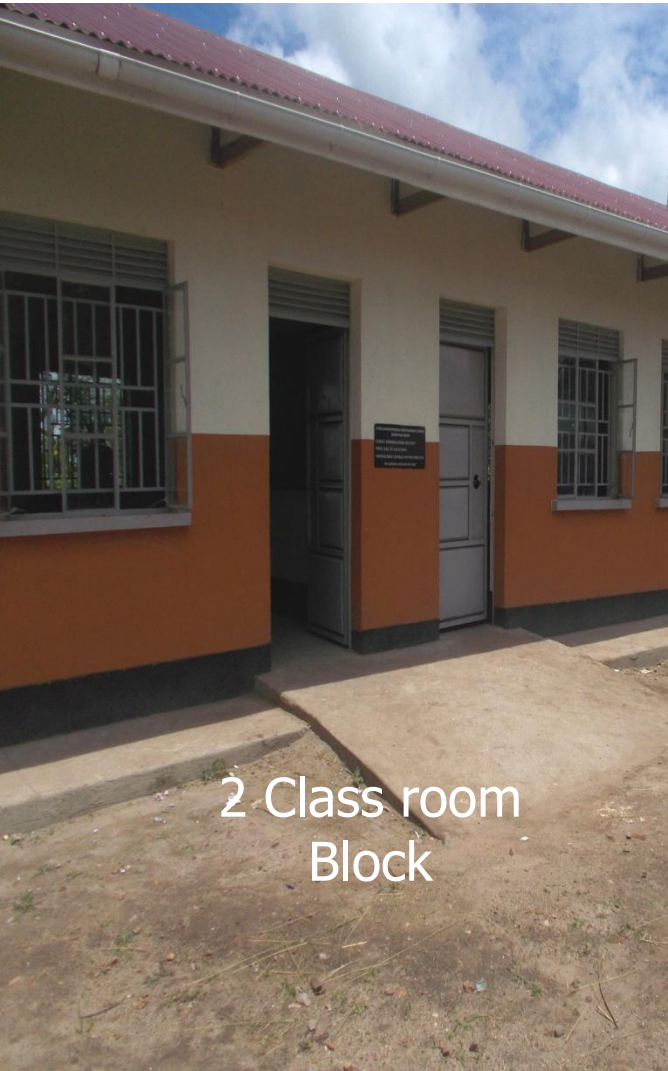
2 Class room Block