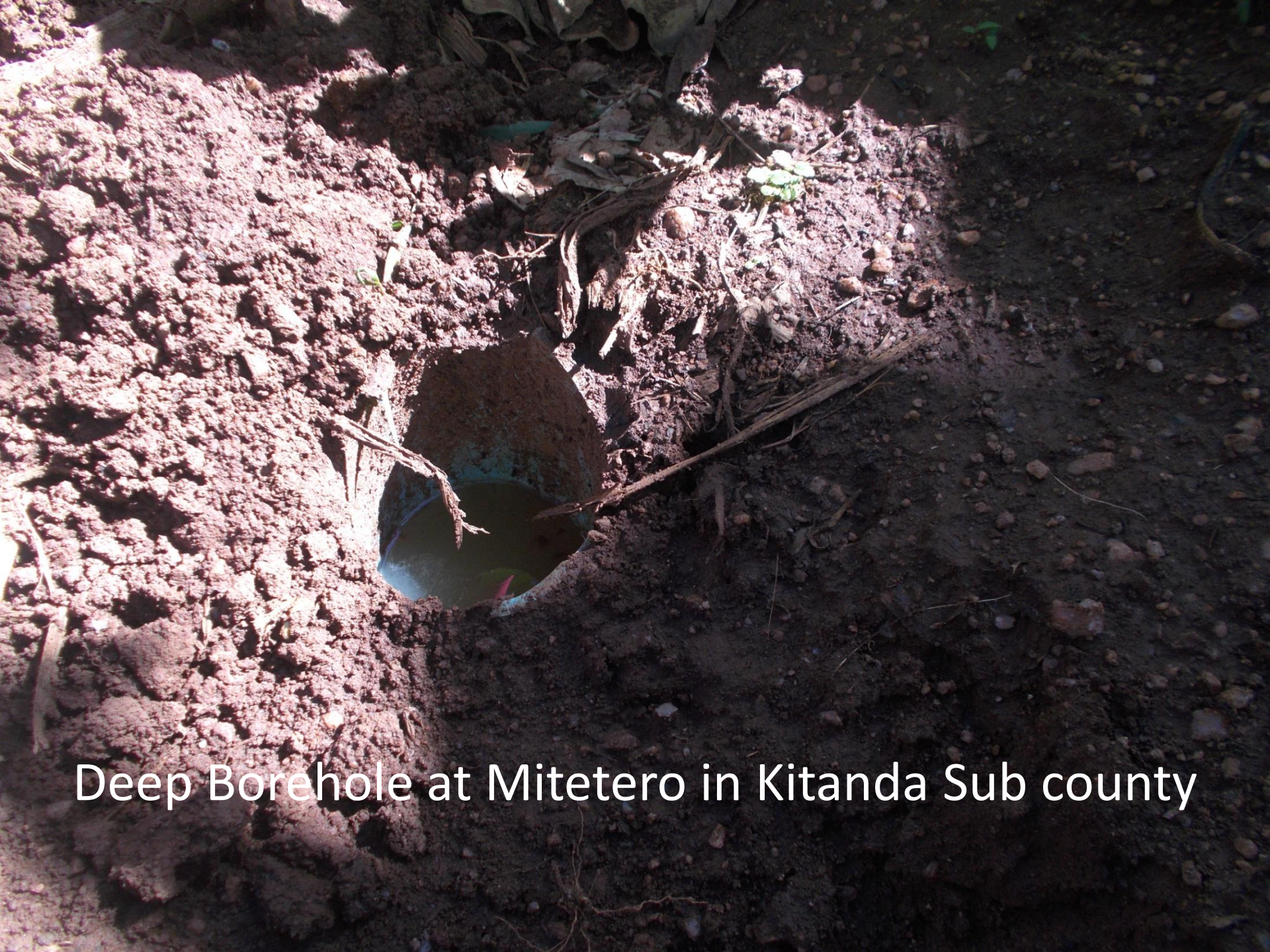
Deep Borehole at Mitetero in Kitanda Sub county