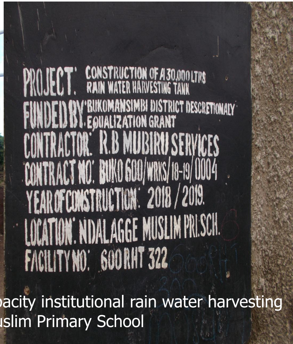
A concrete 30,000 Litre cubic meter capacity institutional rain water harvesting tank at Ndalagge Muslim Primary School