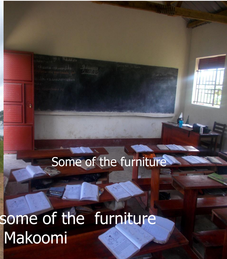
Some of the furniture