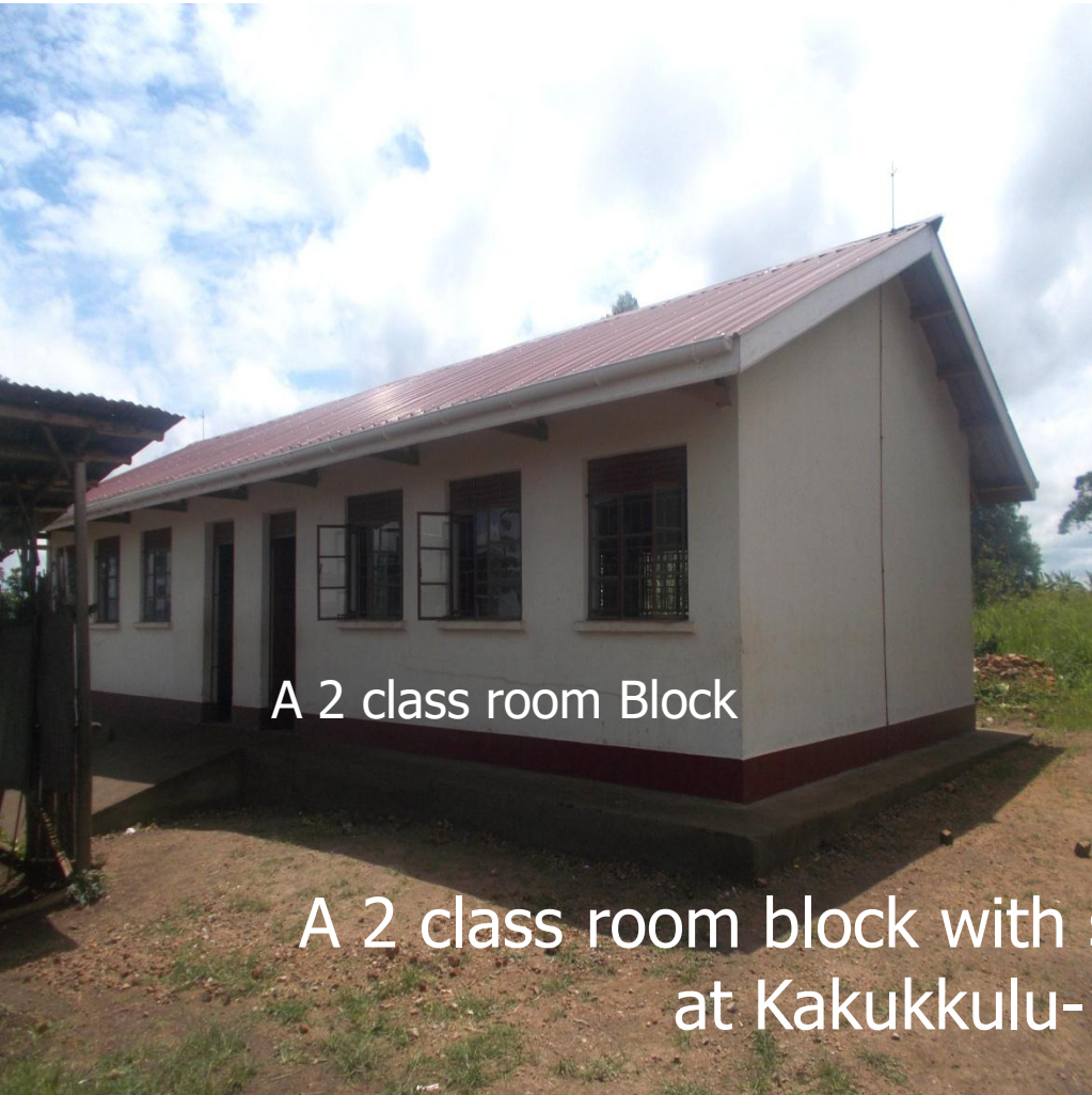
A 2 class room Block