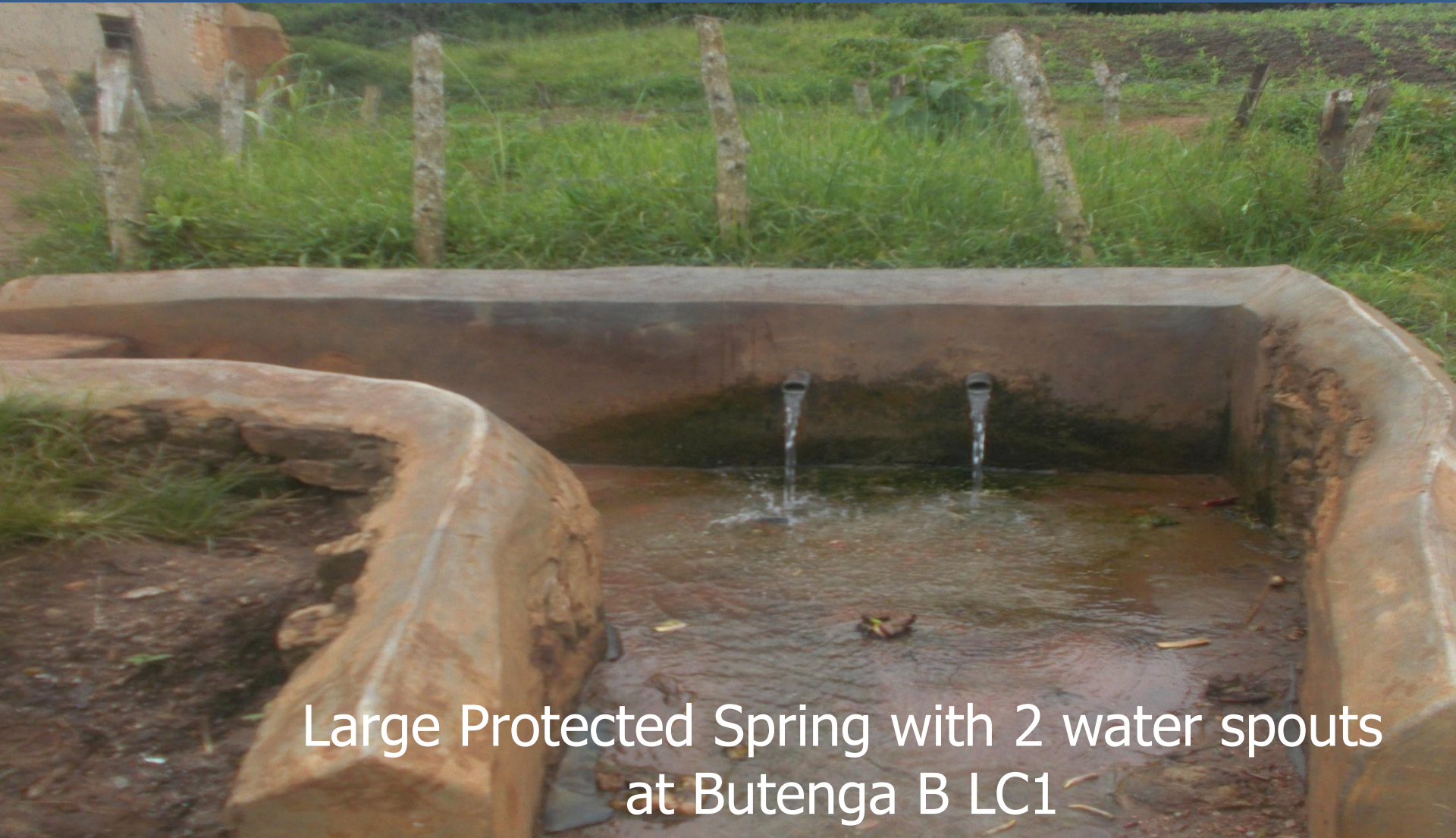
Large Protected Spring with 2 water spouts at Butenga B LC1