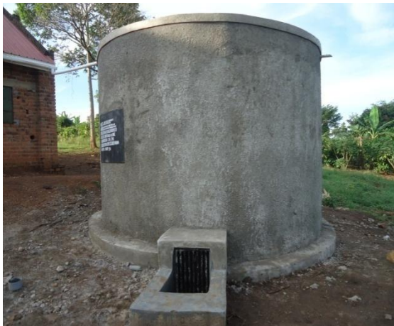
Below: 30,000 Ltrs Rainwater harvesting tank at Seventh day Adventist Church Makomi P/S Bigasa.

PROJECT: CONSTRUCTION OF A 30,000LTRS RAIN WATER HARVESTING TANK FUNDED BY: BUKOMANSIMBI DISTRICT WATER AND SANITATION CONDITIONAL DEVELOPMENT GRANT CONTRACTOR: BEKABYE GENERAL ENTERPRISES LTD CONTRACT NO.: BUKO 600/WRKS/18-19/0002. YEAR OF CONSTRUCTION: 2018 / 2019. LOCATION: SEVENTH DAY ADVENTIST CHURCH MAKOMI FACILITY NO.: 600RHT 324