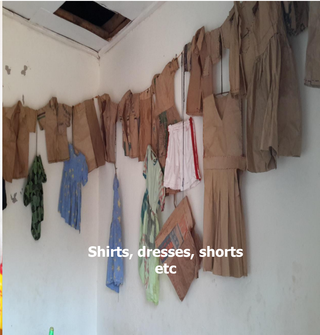
Shirts, dresses, shorts etc