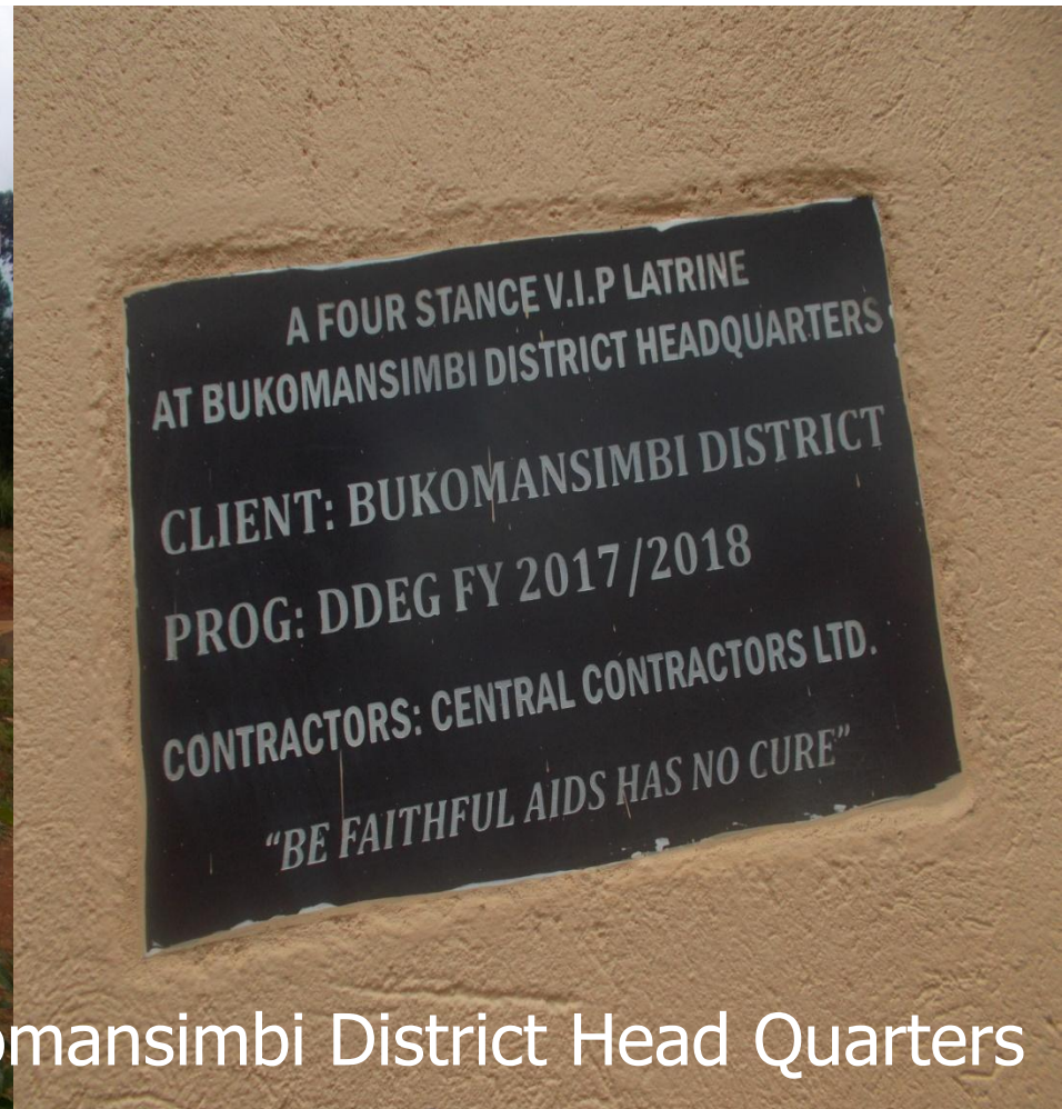
A 4 stance VIP pit latrine at Bukomansimbi District Head Quarters